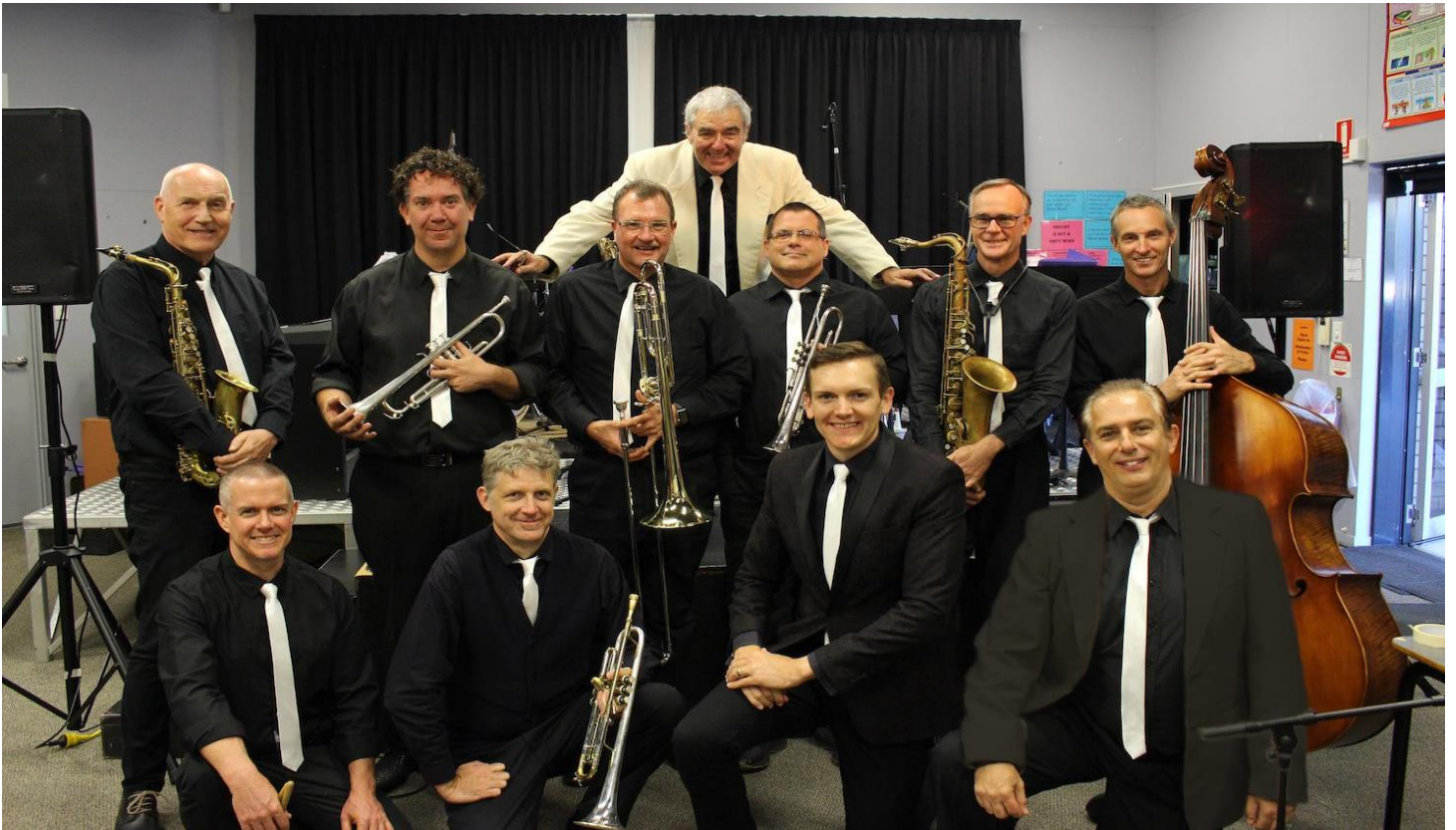
PETE KELLY'S INTERSTATE SWING BAND! (10 Piece)

16 TH FEBRUARY 2020 – CALOUNDRA POWER BOAT CLUB