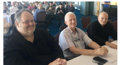
Panel of Judges