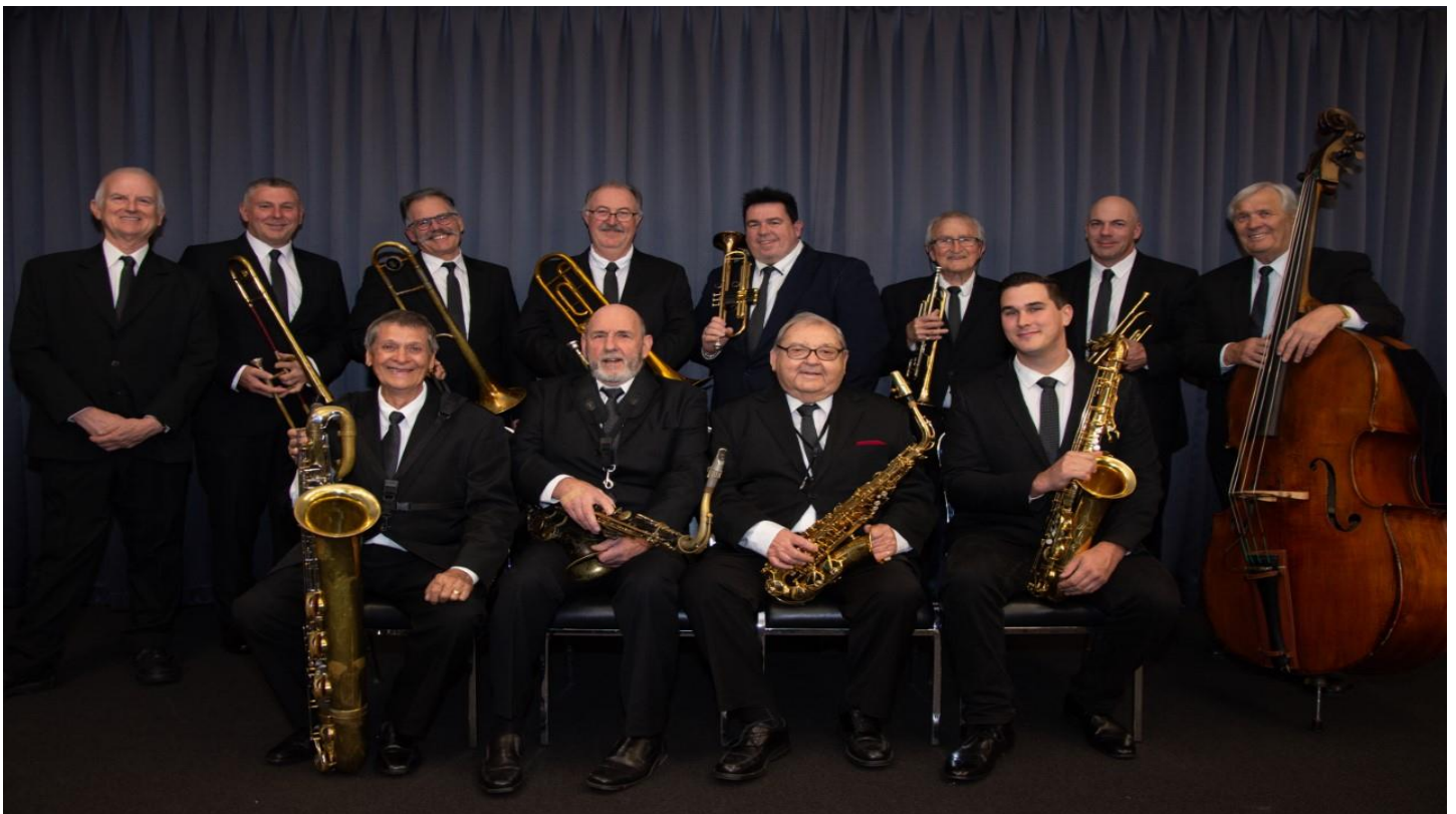
CALOUNDRA POWER BOAT CLUB

15 MARCH – SWEET THUNDER – 13 PIECE BIG BAND!!! 'BATTLE ROYALE' – THE DUKE MEETS THE COUNT